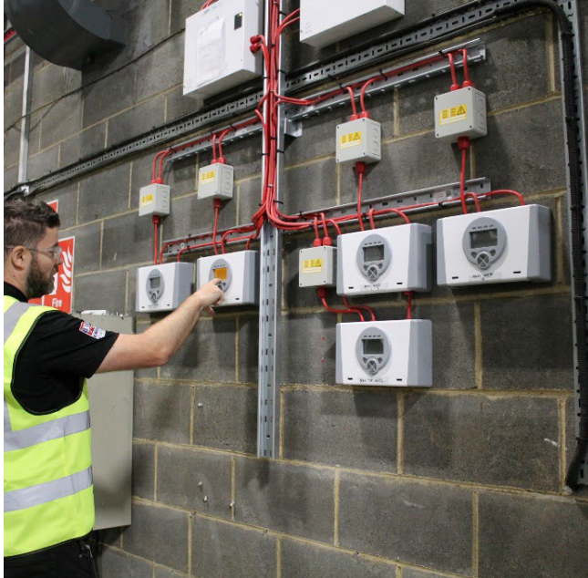
Figure 3: Illumino Ignis engineer commissioning Fireray Hub Reflective controllers at ground level, avoiding repeated