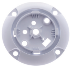
Flush Mount Plate 3000-202